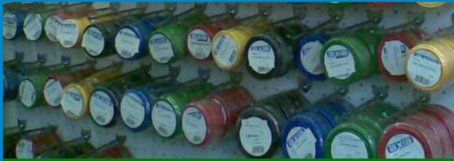
AXIA AUTOMOTIVE WIRE STANDS